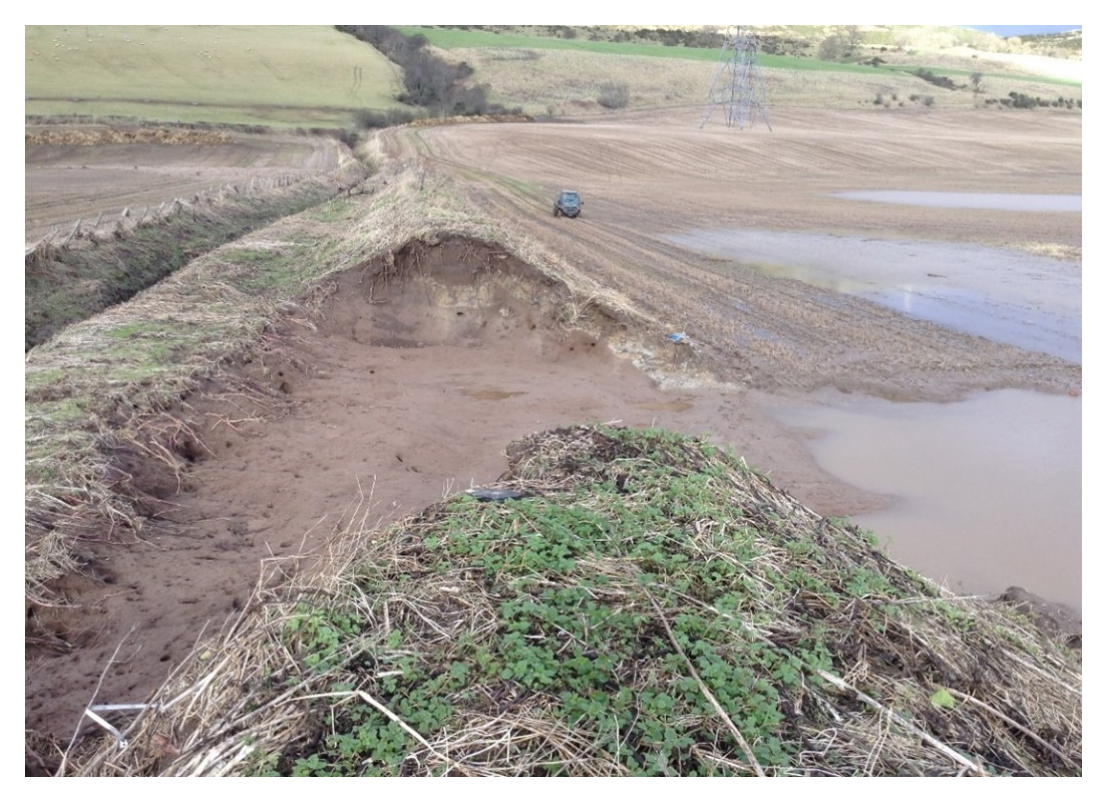
Annex B: Examples of ineligible damaged floodbanks