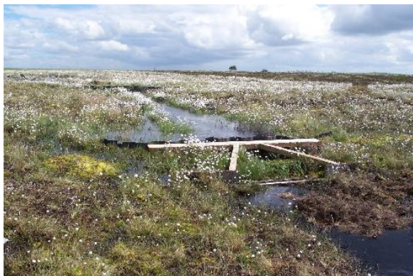
A-frame dam with diagonal timbers linked to the ditch bank

In most cases it is sufficient just to use two 4x4 posts bolted together, supported by two 4"x 4" stobs at either end. By bolting the two pieces of timber together with grain in opposing directions the combined structure will be much stronger than a single piece of wood of similar dimensions. The last two dams at the end of the run should have the diagonal supports which are held in place by stobs. The maximum length of 4"x 4" timber is usually is 3.6 metres. If wider dams are proposed, stagger the length to ensure the timber joints are not opposite each other and so weakening the structure.