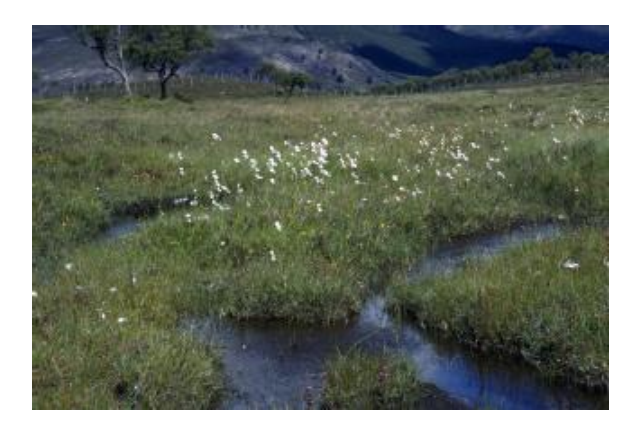
Bog vegetation

The vegetation tends to be dominated by a mixture of sphagnum mosses, sedges such as cotton grass, dwarf shrubs and, in certain areas, purple moor-grass and deer grass. Sphagnum moss is more common and forms continual carpets of moss.