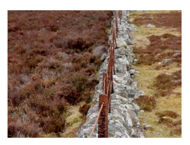
On the right side of the dyke the heather has been suppressed by grazing, and has been replaced by grassy patches

Under extreme grazing plants exist as single stem drumsticks, very tight, small topiary bushes, or the stems remain at ground level where annual shoots appear in summer before they are grazed-off every winter.