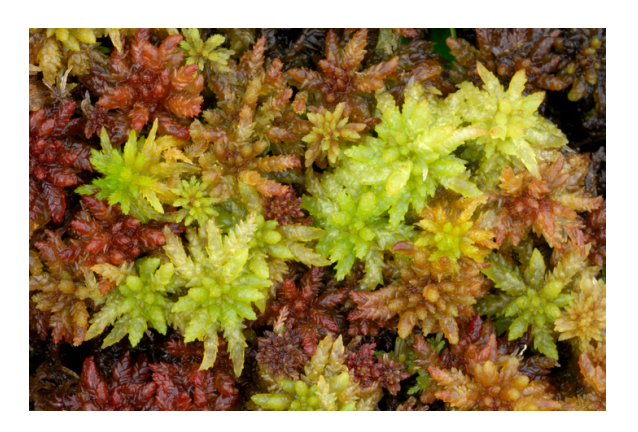
Sphagnum mosses